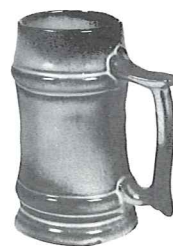
*M2—18 OZ. STEIN—3.00