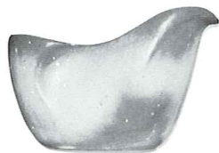
4A—8 OZ. CREAMER—2.00