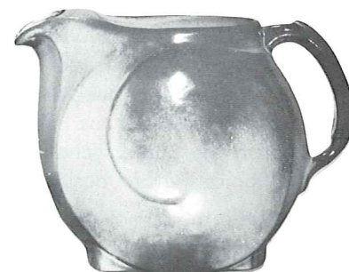
*4D—2 QT. PITCHER—6.00

THIS PAGE AVAILABLE IN PRAIRIE GREEN, DESERT GOLD, BROWN SATIN AND ROBIN EGG BLUE, EXCEPT WHERE NOTED*