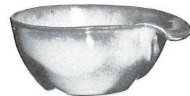
*4X—14 OZ. CEREAL—2.00