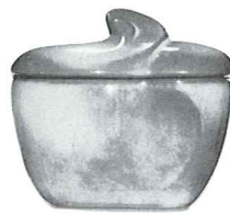
4B—SUGAR WITH LID—3.00