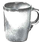
*5CC—5 OZ. TEACUP—2.00