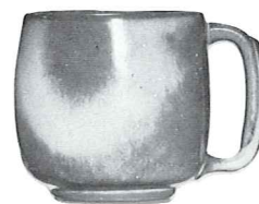
*4M—18 OZ. MUG—3.00