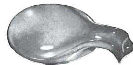
*4Y—6" SPOON HOLDER—2.00