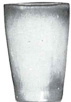
*5L—12 OZ. TUMBLER—2.25