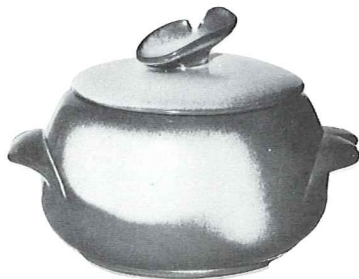
*4V—2 QT. BAKER/BEAN POT—6.00