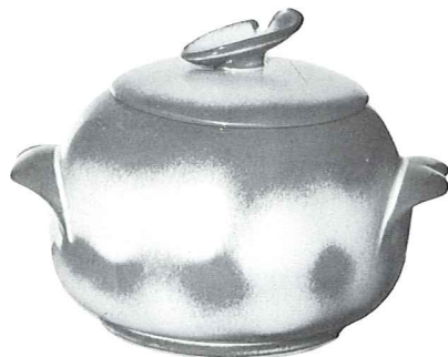
*4W—3 QT. BAKER/BEAN POT—8.00