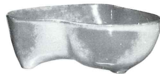
*4N—24 OZ. VEGETABLE—3.00