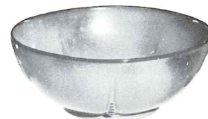
*224—8" ROUND BOWL—4.00